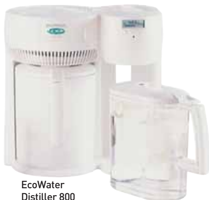
EcoWater Distiller 800